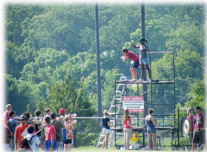
Band members take direction from instructors as they work through the routine step by step. The band's directors and instructors, who spend most of practice on a 20-foot high platform so they can see the whole field, work at least as hard as the students.