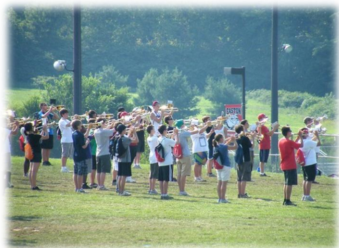
The brass section of the band runs through a few bars of the show.