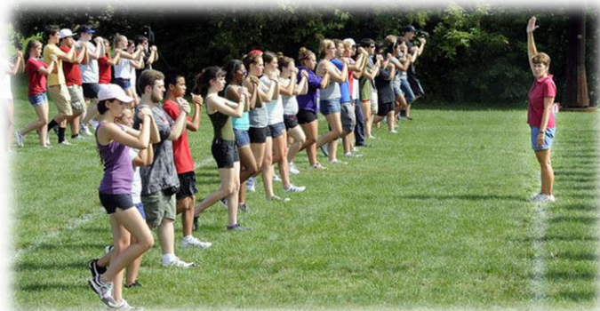
Tuesday, August 09, 2011 7:05 PM