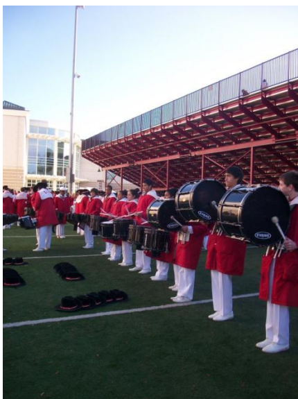
The drumline preps for the big game